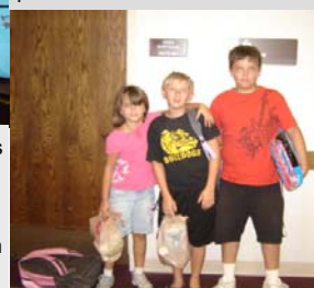
A few of the backpacks donated to First Call for Help for Backpacks for Kids.

A brief look back at some of the events during the 2010 United Way of Ellis County Campaign.