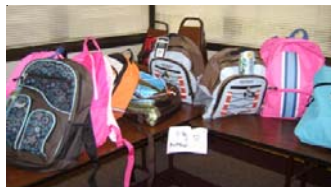
First Call for Help provided backpacks and supplies for nearly 400 area children. Western Kansas Association on Concerns of the Disabled also distributed gas vouchers to each family.